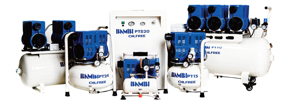
Max Duty Cycle = 65%

Bambi Air Ltd was established in 1977 and enjoys a worldwide reputation for quality and after-sales care and service. Dedicated to the manufacture of innovative and meticulously engineered products, our extensive range is as diverse as our customers themselves.