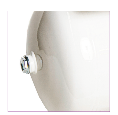
Internally Coated Receiver