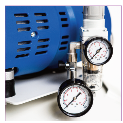
10 Micron Outlet Filter and Adjustable Pressure Regulator