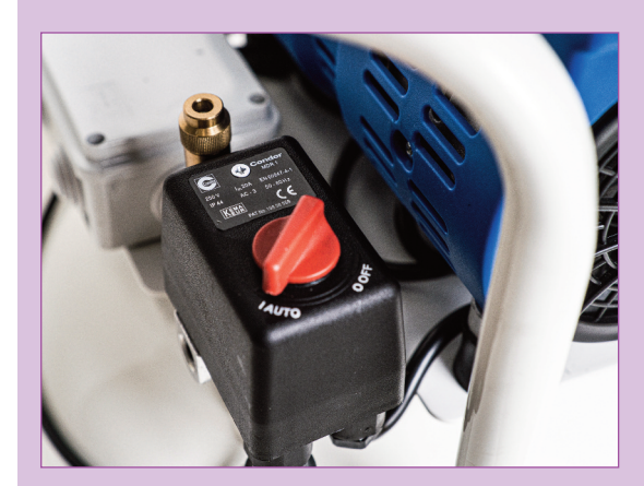
Condor Pressure Switch

Every PT compressor is protected by a comprehensive 12 month warranty extending to 5 years on the air receiver.